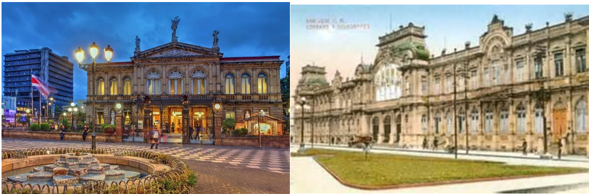
Antique buildings like National Theater and Costa Rica Post Office.