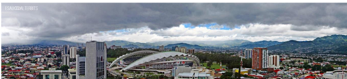
San José, Costa Rica Capital

TITLES: Please see Table for Direct Titles effective from 1 July 2014, Table 1.24a and Table 1.24b, Continental & Regional Tournaments ( http://www.fide.com/fide/handbook.html?id=173&view=article ).