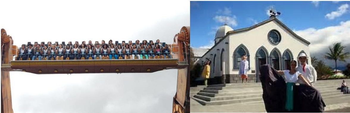
Parque de Diversiones (Amusement Park) and Pueblo Antiguo (Old Town)